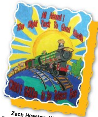
Zach Heasley- West Virginia First Place, 2008 Tar Wars National Poster Contest